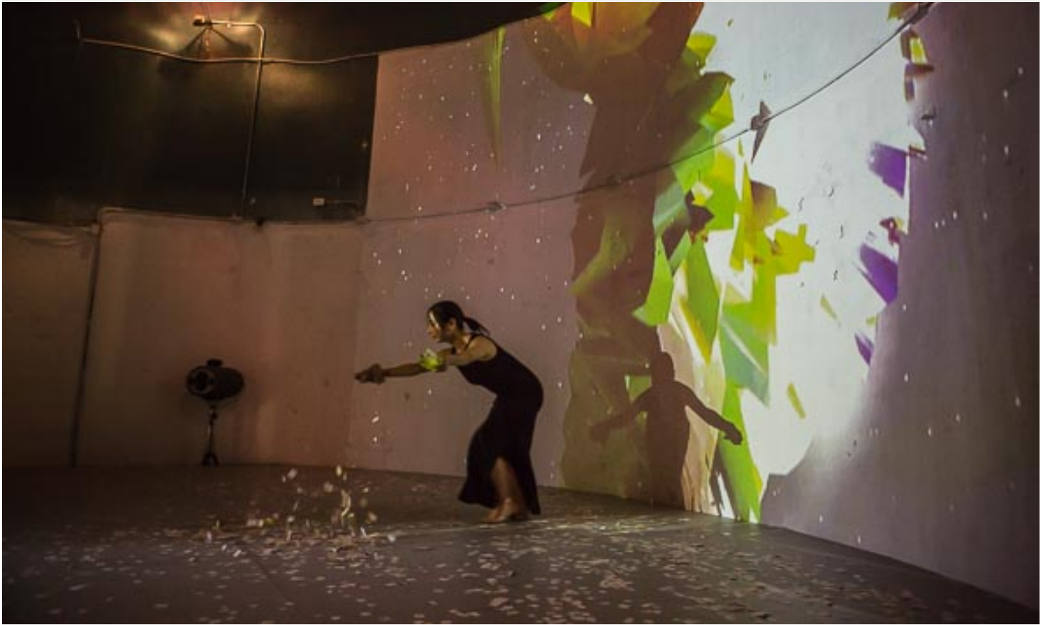
The Peggy Baker dance show is an interactive experience in one of the silos with the coolest acoustics in the whole place.